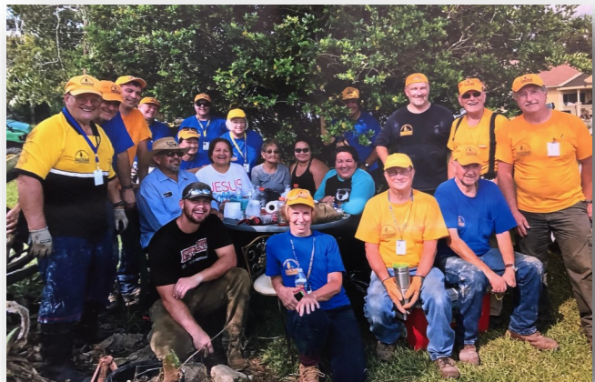
Houston, Texas Hurricane recovery

Close to the end of the first day, with true longing to understand, the homeowner asks, “Why do y’all do this?” The chaplain then gently takes his hand and says, “we do it because we love God, and He sent us here to show you that He loves you very much! Even in these devastating times, He has never left your side. He loves you so much that He became flesh and dwelt among us as Jesus the Christ. He suffered and died on the cross as a ransom for our sins, rose from the dead and is now seated at the right hand of God. He is reaching His hand down from His holy throne, asking you to take it and accept the free gift of salvation that He offers. For we have all sinned and fallen short of the glory of God. Will you accept His gift?” The homeowner drops his head and says, “I don’t know, I don’t think I’m ready for that.”