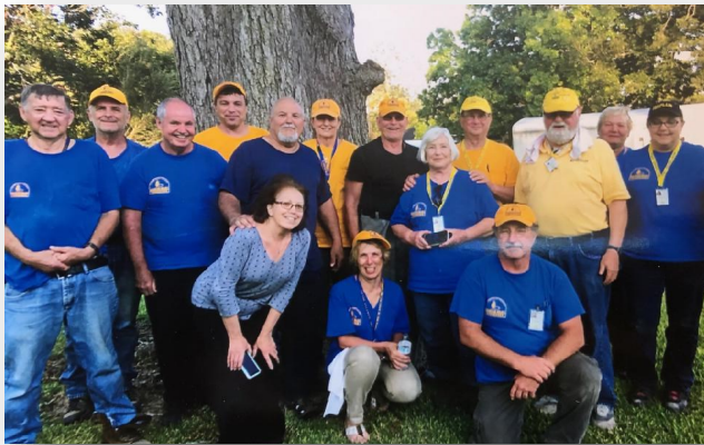
Baton Rouge, Louisiana Hurricane recovery

It may be early, but there is an atmosphere of joy in the air because we are about to go serve, and bring Christ's hope to people who have lost