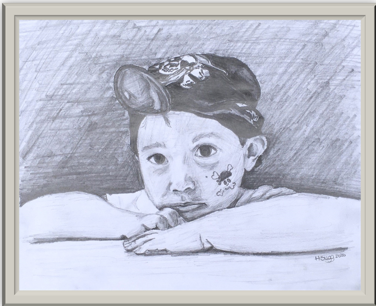
Waiting for Cake Pencil Drawing Heather Sugg