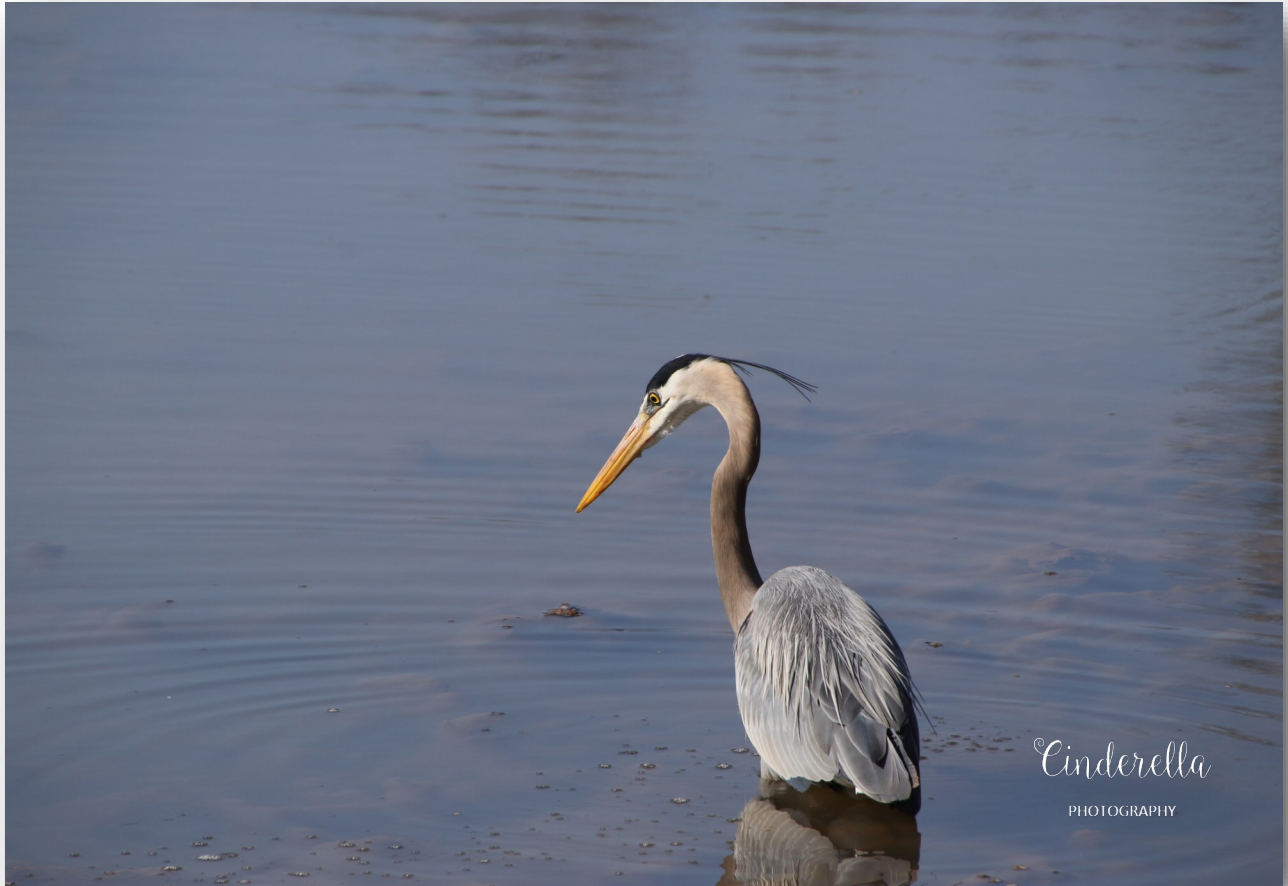
Waiting for Lunch Great Blue Heron Dunbar Cave